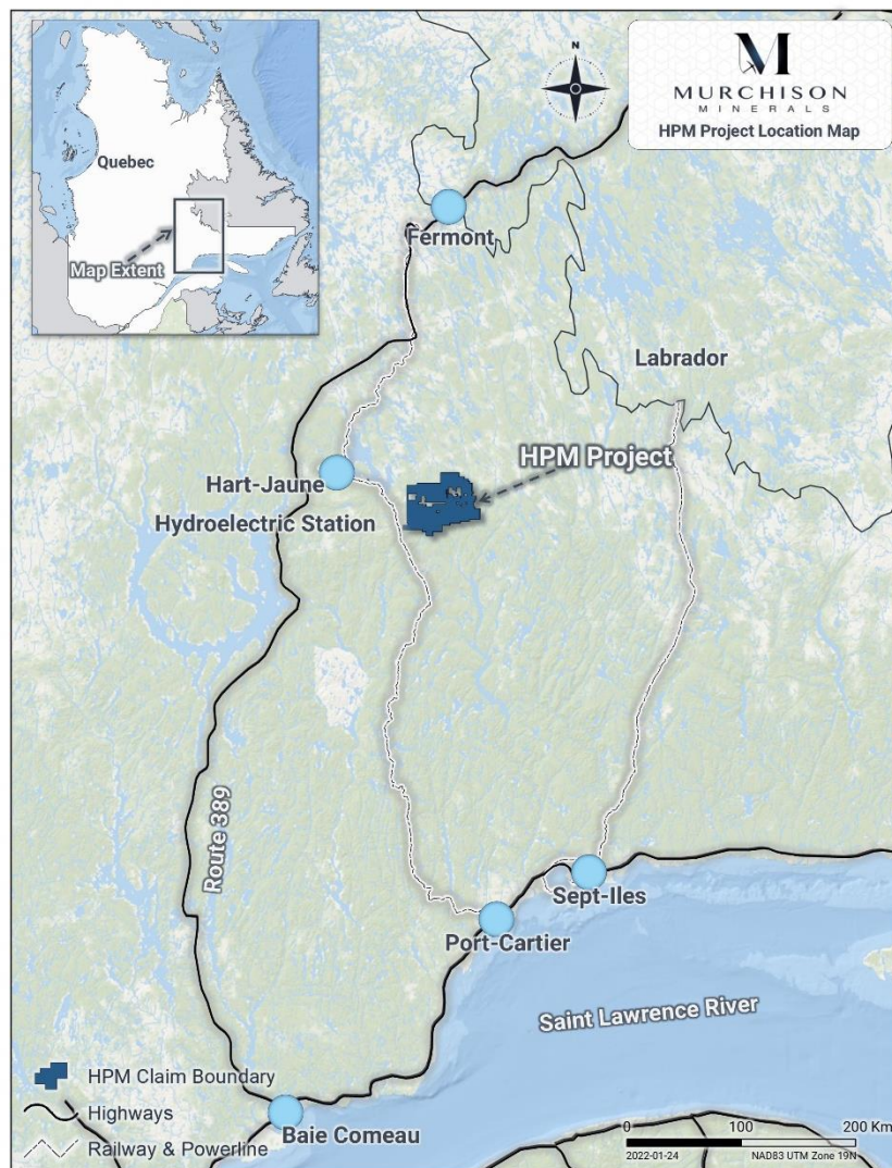
Figure 4: HPM Location Map

The HPM Project is located within the Haut-Plateau de la Manicouagan area, east of the Manicouagan structure, the site of a major 215 Ma impact event. The extensive reservoir at Manicouagan supports five hydro-power plants. The existing Quebec Cartier rail line, located eight kilometres west of the PYC target area, links Labrador City to Port Cartier and Sept Iles, two major iron ore port facilities.