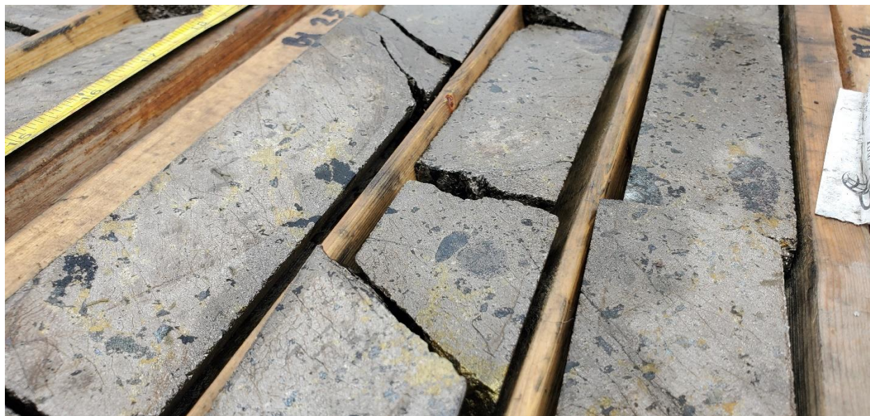
Figure 2: Drill core from BDF with observable pyrrhotite (iron sulphide), chalcopyrite (copper sulphide) and pentlandite (nickel sulphide) mineralization from an interval in Hole HPM08-04 which assayed 1.74% Ni, 0.66% Cu and 0.09% Co over 15.06 metres.

The Company has also recently compiled the drill core from the 2008 exploration program – at the BDF Zone – to a core storage facility in Saguenay, QC. The 2008 exploration program was operated by Murchison Minerals' predecessor company, Manicouagan Minerals, that completed 13 of the 25 drill holes that currently make up the BDF Zone. The mineralized portions of the drill core were stored indoors and remain in great condition (Figure 2). Additionally, the 2008 drill core is now undergoing relogging and geochemical sampling, which will be used to update the current geological interpretation. Those results will also assist in targeting expansion areas at BDF during the summer drill program.