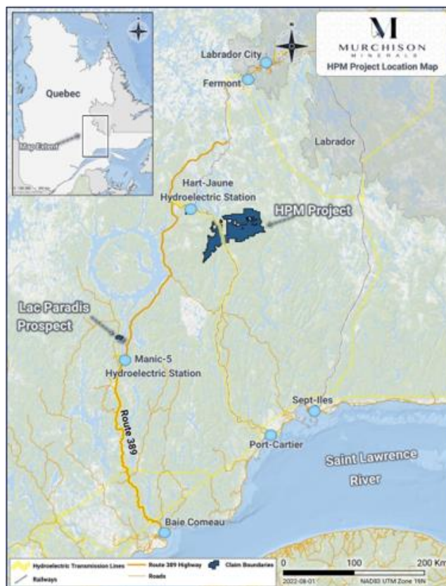
Figure 1: Location map of the HPM Project, located approximately 220 km North of Sept-Iles, QC. .